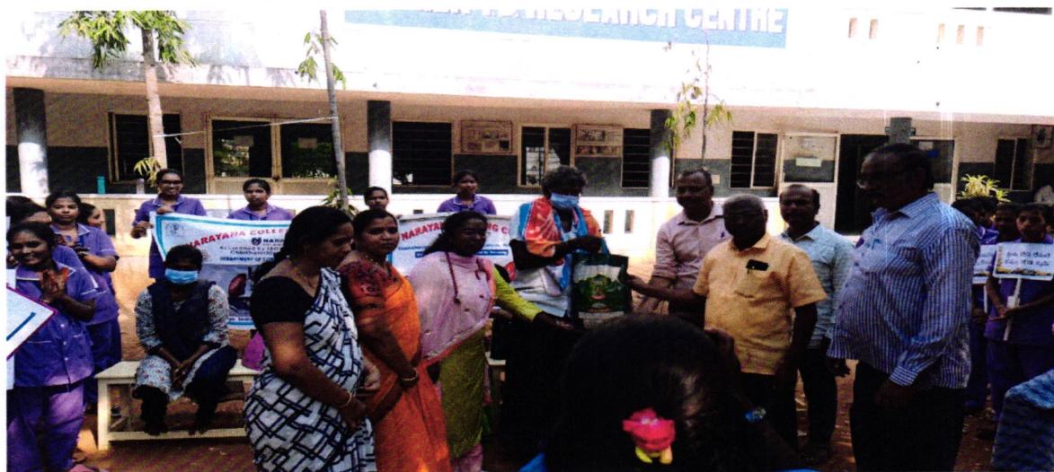
Distributing rice bags to the group